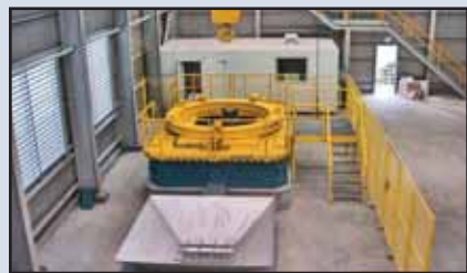
Crucible Cleaning Machine