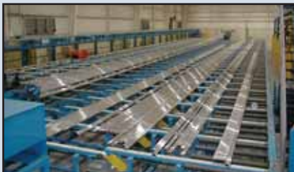
Complete Handling System