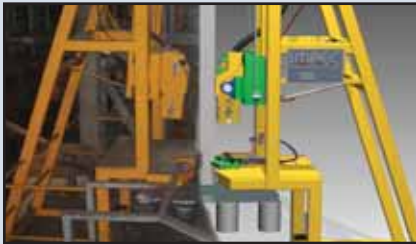
Rod Grinding Machine