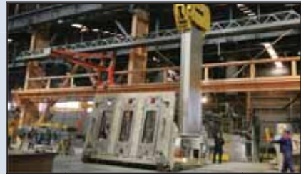
Slab Bar Handling