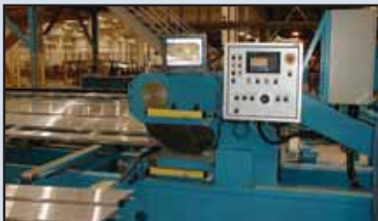
Stretchers up to 200 tonnes