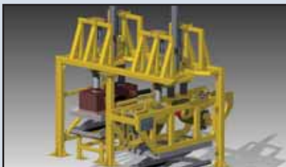
Stub Straightening Machine