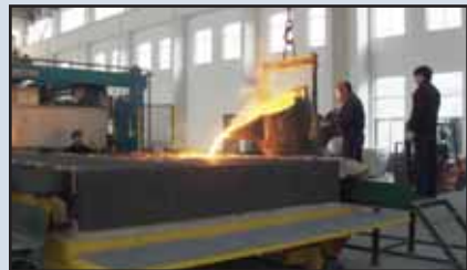
Electric Cathode Preheater